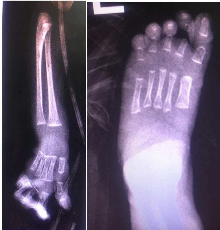
Figure 2: Radiography of foot and hand. Left (deformed hand). Right (club foot).