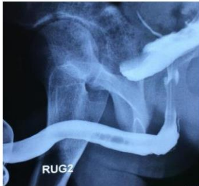
Figure 2: Postoperative pericatheter retrograde urethrogram showing a clearly defined urethra without any strictures or diverticulum.