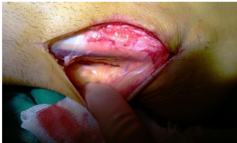
Figure 3: Finding the plantaris tendon on anteromedial aspect of Achilles tendon