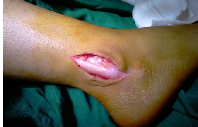
Figure 2: after incision. Peroneal tendons over lateral malleol, covered by deep fascia