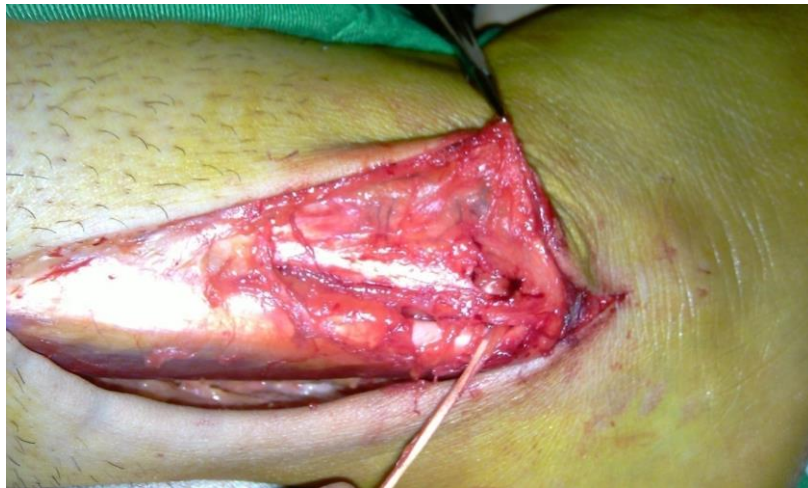
Figure 5: Plantaris tendon went through two tunnel and is ready to be sewn over itself