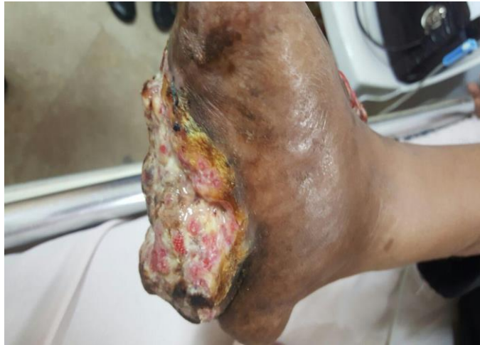
(Figure 1) : huge cream-brown cauliflower- like mass