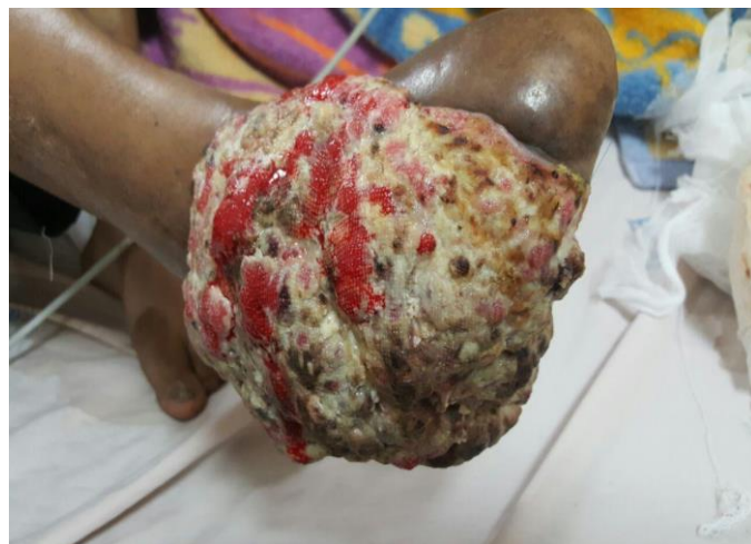
(Figure 2) : huge cream-brown cauliflower- like and ulcerative mass