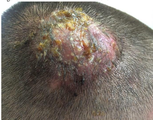
Figure 3: Case number 2 before treatment