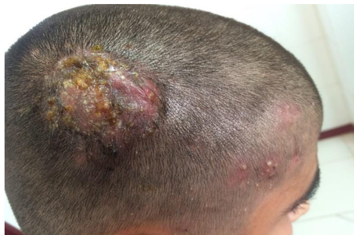
Figure 4: Case number 2 after treatment