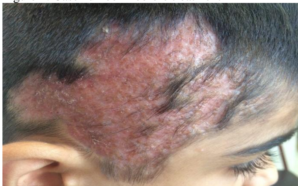
Figure 2: Case number 2 after treatment