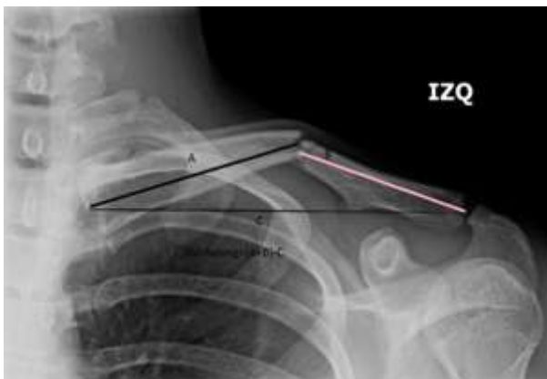
Figure 3 - How to calculate bone shortening in the form of bulging.