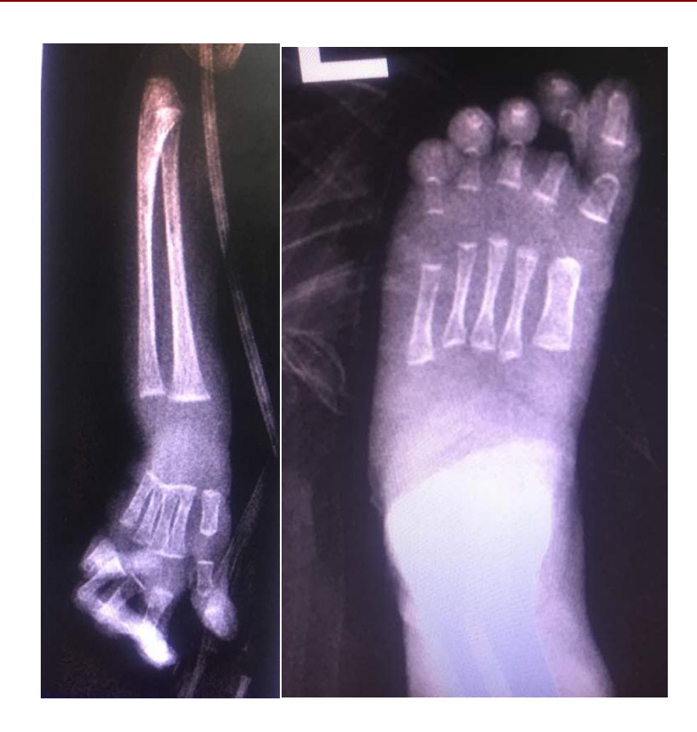
Figure 2: Radiography of foot and hand. Left (deformed hand). Right (club foot).