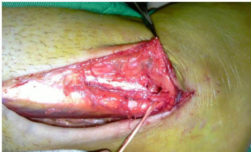
Figure 5: Plantaris tendon went through two tunnel and is ready to be sewn over itself