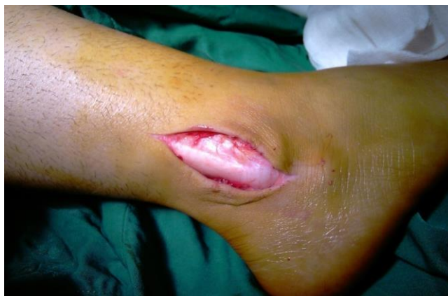
Figure 2: after incision. Peroneal tendons over lateral malleol, covered by deep fascia