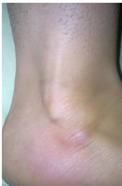
Figure 1: dislocated tendons can be seen before operation.