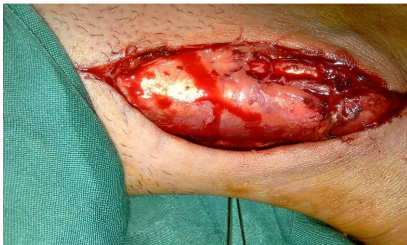
Figure 6: delta shaped reconstructed retinaculum prevents the peroneal tendons from being dislocated again