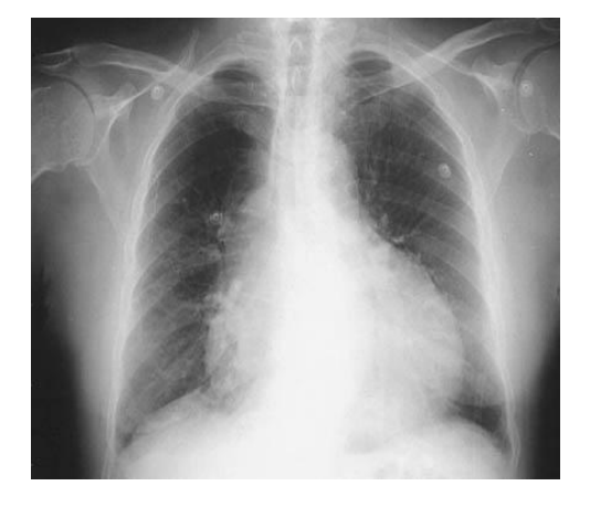
Figure 3: Posterior pericardial effusion impending tamponading