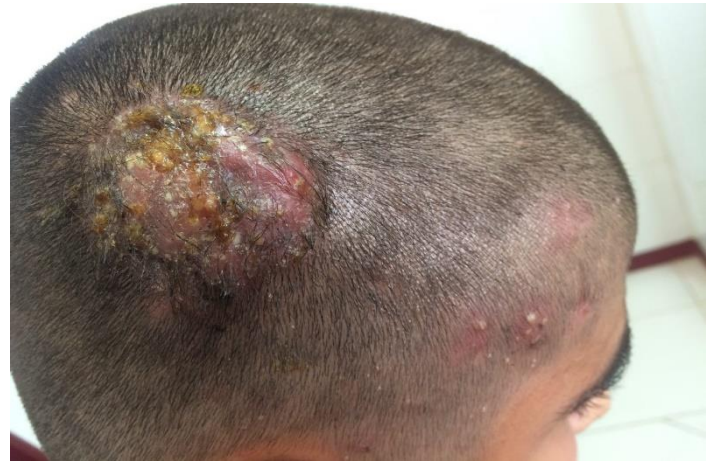
Figure 4: Case number 2 after treatment